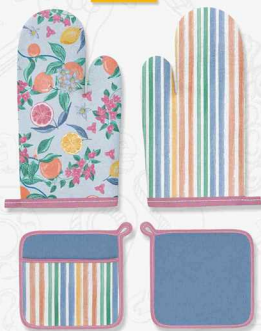
POT HOLDER/ OVEN MITT SET